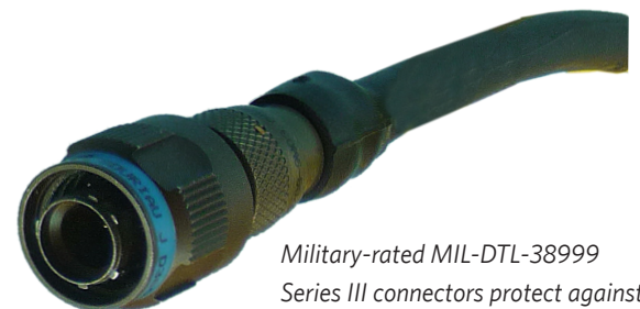
Military-rated MIL-DTL-38999 Series III connectors protect against vibration, shock, water and more.