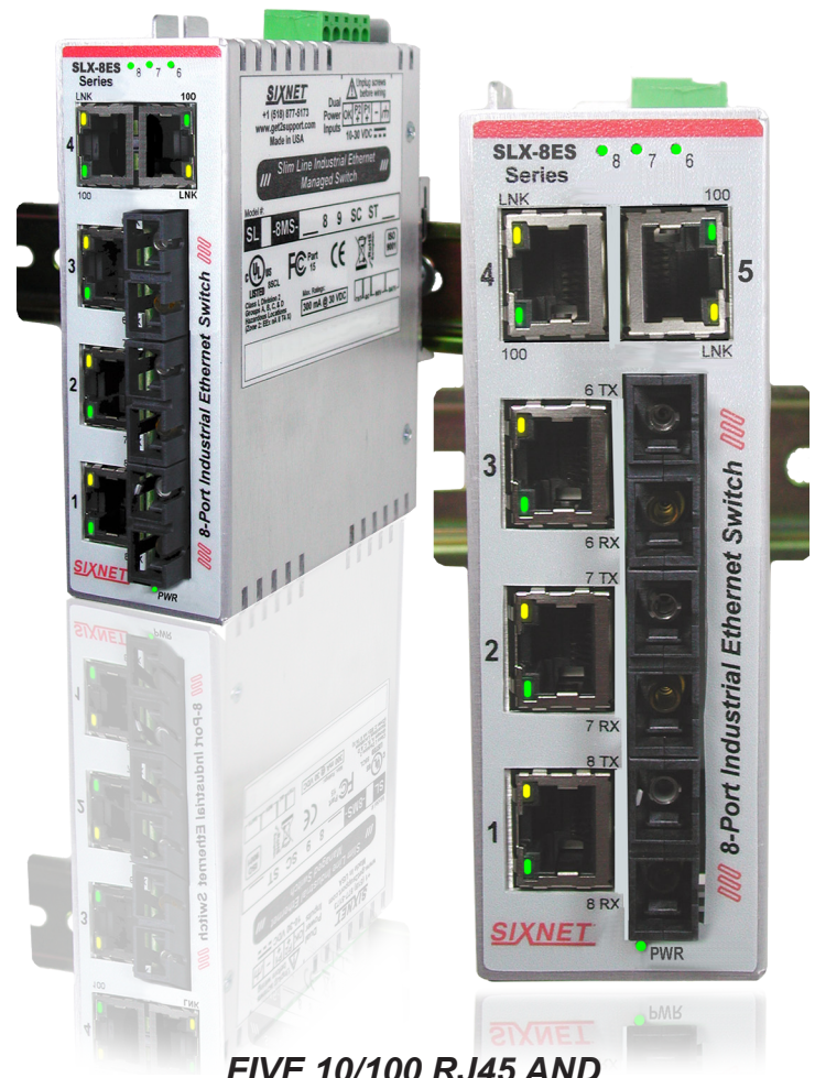
FIVE 10/100 RJ45 AND THREE FAST ETHERNET FIBER OPTIC PORTS