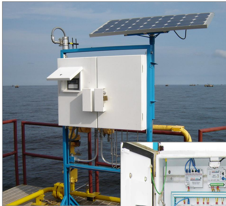
POZomatic Control Cabinet Exterior and Interior Views