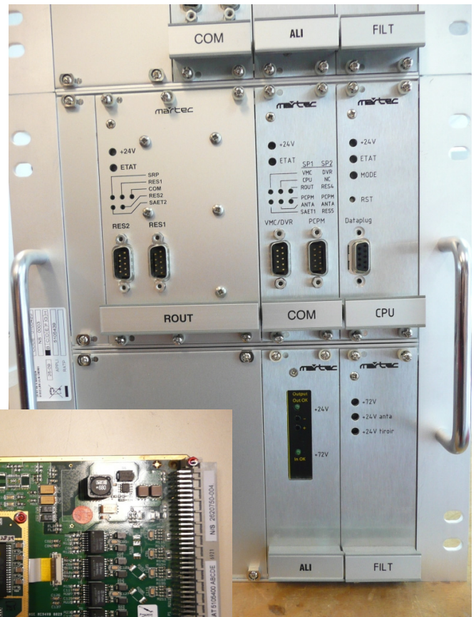
éolane mother board is integrated with a Eurofer rack